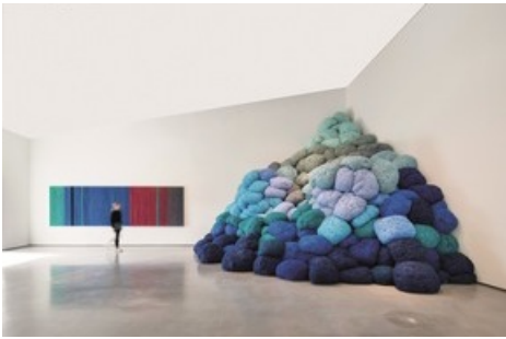
Installation by Sheila Hicks, Nowhere to Go , The Hepworth Wakefield, 2022