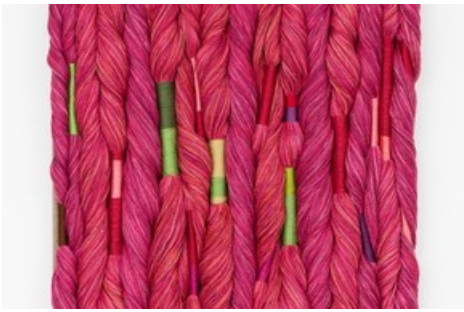
Sheila Hicks, Pigment Sticks, 2014-2015

Diese Meldung kann unter https://www.presseportal.ch/de/pm/100059306/100900247 abgerufen werden.