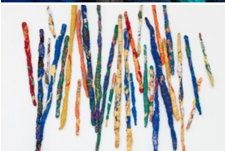
Sheila Hicks, Pigment Sticks, 2014-2015