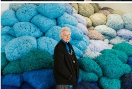
Sheila Hicks in front of her work Nowhere to Go, 2022, installation view, The Hepworth Wakefield