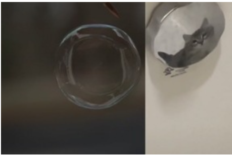
Jijia Zhang, Between the Acts , 2022, video still, HD video, 38'33", 16:9, color, sound, Courtesy the artist