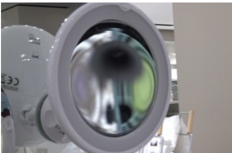
Jijia Zhang, Beautiful Mistakes (after LB), 2022, Videostill, HD Video, 08:58, 16:9, Color, Sound, Courtesy the artist