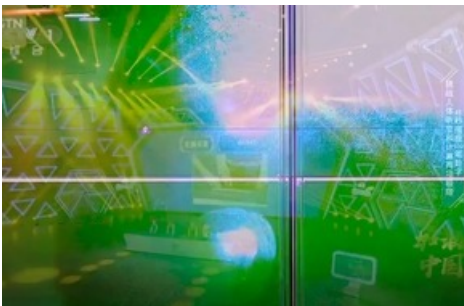
Jijia Zhang, Between the Acts, 2022, video still, HD video, 38'33", 16:9, color, sound