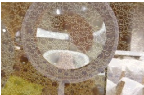
Jijia Zhang, Beautiful Mistakes (after LB), 2022, Videostill, HD Video, 08:58, 16:9, Color, Sound, Courtesy the artist