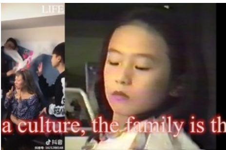
Jijia Zhang, Untitled (After Love) , 2021, Videostill, HD Video, 16:9, 16'26", color, sound

Diese Meldung kann unter https://www.presseportal.ch/de/pm/100059306/100903601 abgerufen werden.