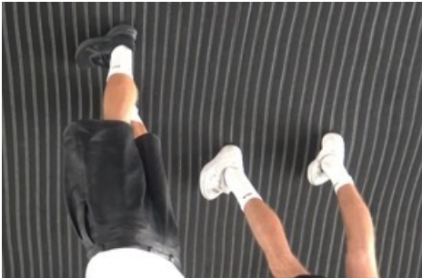
Jijia Zhang, Beautiful Mistakes (after LB), 2022, Videostill, HD Video, 08:58, 16:9, Color, Sound